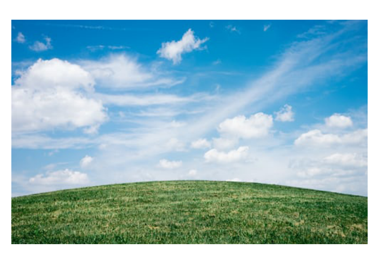
Having 10 mins breaks to refocus on tasks