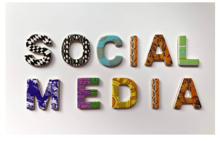
Reduce time spent here to minimise anxiety