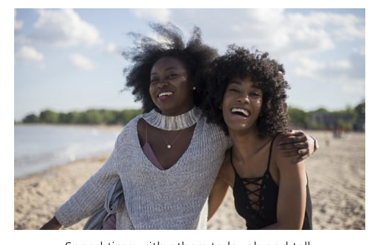
Spend time with others to laugh and talk