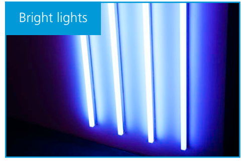
Can the lighting be adjusted to be more suitable