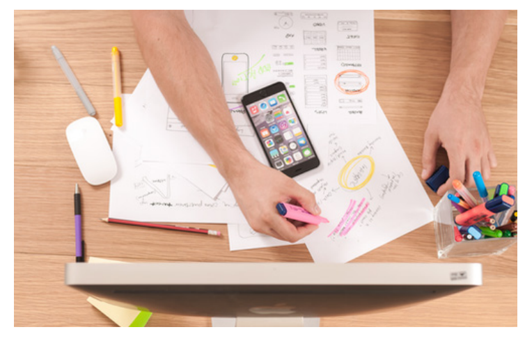
Setting a realistic plan to complete tasks on time

Here are a few ideas that you could encourage to lower stress levels.